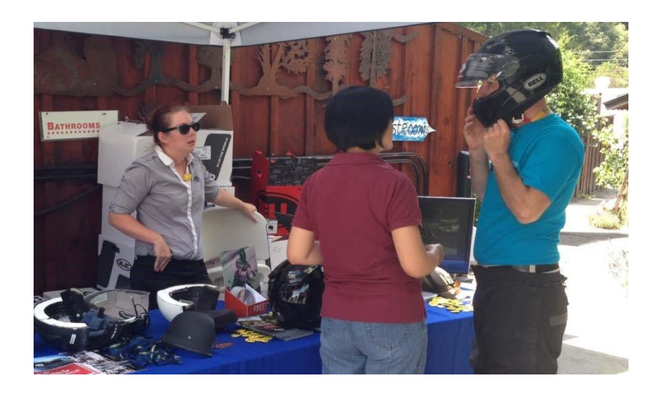
Figure 3a. Snell staff members fit a participant with a helmet at Alice's Restaurant

In addition to the helmets provided for participants, the Snell Safety Education Center provided educational DVDs, brochures, charts, and demonstration helmets. Snell staff members were present at each event to answer questions and interact with participants. Individuals who presented a noncompliant helmet were fitted with a new DOT/Snell M2010 helmet and offered the helmet free of charge in exchange for the non-compliant helmet. A helmet sign-out log kept record of each recipient's name, phone number, email address, and helmet received. This log was used in the survey portion of the program to contact participants. A few photographs taken at exchange events can be seen below.