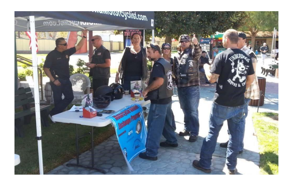
Figure 3b. Motorcyclists visit the exchange booth at Tom's Farm